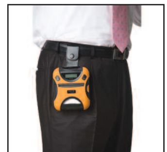
Belt Clip Included